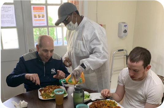
Residential support staff lovingly prepare family meals for our residents every day.