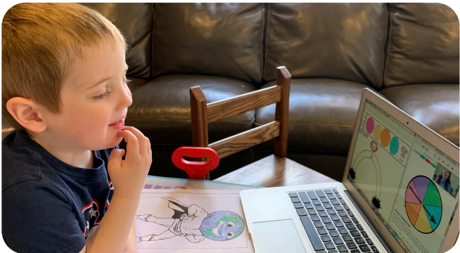
When The Children's School for Early Development was faced with a shift to remote learning, our team quickly launched Google Classrooms and began delivering services virtually.

P.S.: A recurring gift from our family of supporters, usually made monthly, protects the long-term financial health of The Arc Westchester. It's easy and secure – to learn more, visit: www.arcwestchester.org