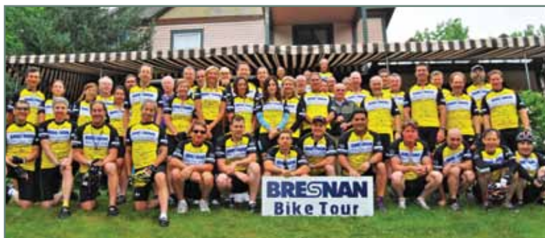
Bikers with the Bresnan Bike Tour rode from New York to Vermont to raise funds for the Arc of Westchester Foundation and Special Olympics New York Hudson Valley Region.