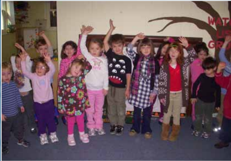
The Children's School for Early Development has classes in community-based settings throughout Westchester County, including the Country Children's Center in Katonah. The children learn, play and build social skills.