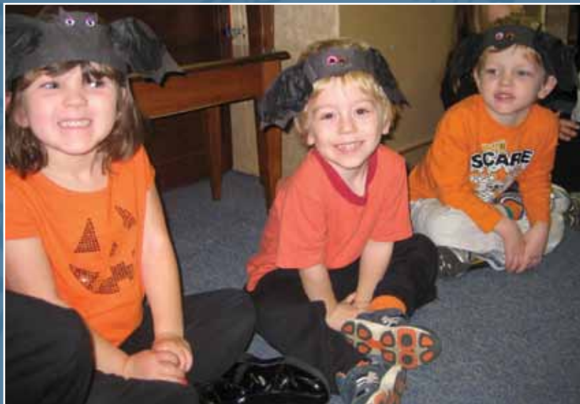
It's Halloween time and that means fun parties and friendship-building for boys and girls at the Country Children's Center in Katonah.